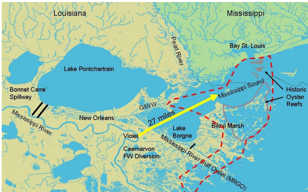
Figure 2: Map depicting the 2006 proposal to expand the Mississippi River freshwater diversion at Violet, LA. The project proposes a constriction of the MRGO channel south of Lake Borgne. The target benefit area for oyster enhancement (brackish marsh) is outlined in red. Historic reefs are shown in gray. (source, 2006 LPBF 8 & 9 ).