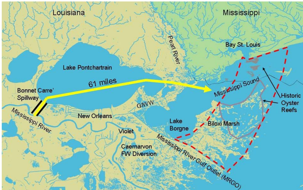
Figure 1: Map depicting the 1984 Feasibility Study’s preferred alternative to construct a new Mississippi River diversion at the Bonnet Carré’ Spillway. The project assumed the MRGO would remain open and continue to elevate salinity in Lake Borgne. The target benefit area for oyster enhancement is outlined in red. (source, 1984 Feasibility Study 2 ). Historic reefs are shown in gray.