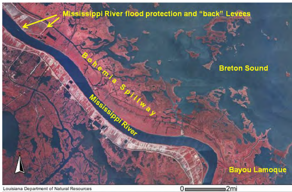
Figure 1: Bohemia Spillway area is east of the Mississippi River downstream of the terminus of the Mississippi River levee.

The Bohemia Spillway area is defined here as the 12 mile reach on the east bank of the Mississippi River approximately 45 miles downriver of New Orleans extending below the terminus of the Mississippi River (MR&T) levees to Bayou Lamoque ( Figure 1 ). The Bohemia Spillway area has a complex legal and historical legacy since approximately 33,000 acres were authorized to be expropriated in 1924 by the Louisiana state legislature (United States Court of Appeals, the Fifth Circuit, 2002). Although the legislature moved to return the property in 1984, it was not until 2006 that heirs to the prior landowners won back their property through more than a decade of litigation.