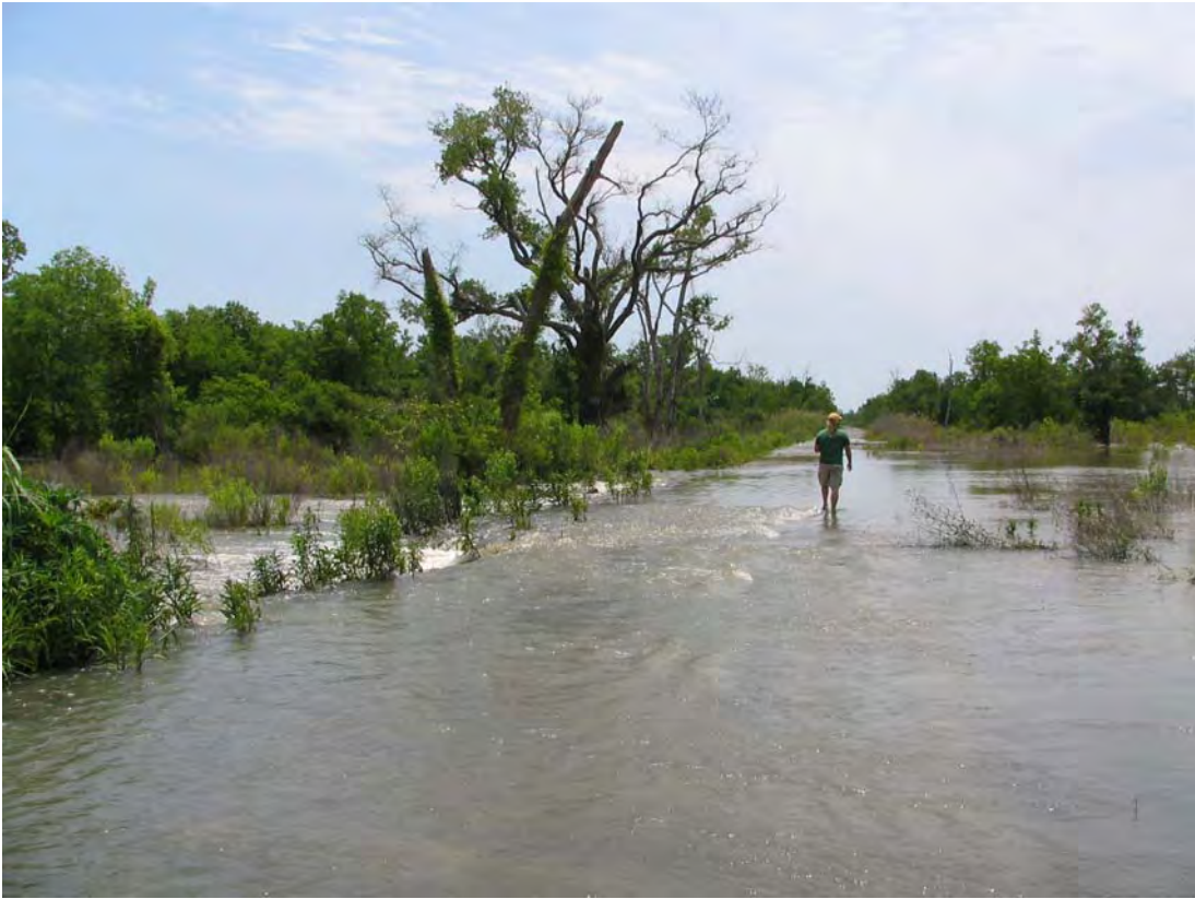
Figure 4: Mississippi River flow overtopping the road on the natural levee within the Bohemia Spillway area during high water on May 5, 2008