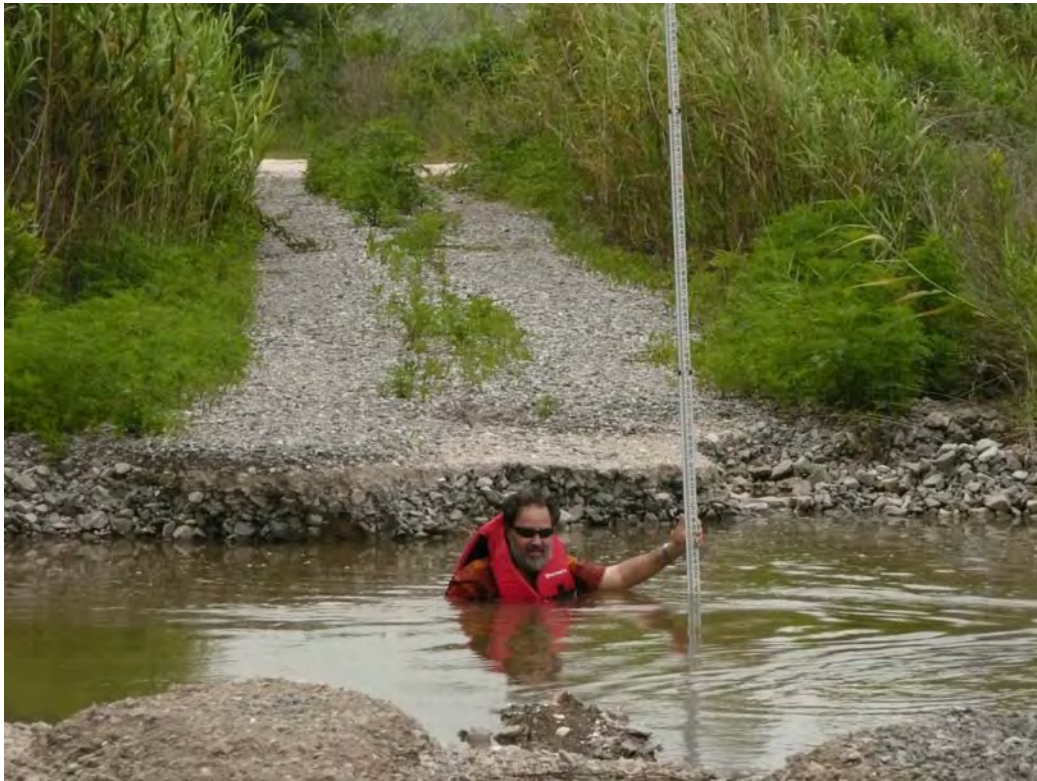
Figure 3: Mississippi River discharge through a breach eroded through the road and into the natural levee within the Bohemia Spillway area during high water on May 24, 2008.

Although overtopping observed in 2008 was influenced by the road and other human alterations, the 2008 event and future flood events at Bohemia Spillway may represent the best modern analogue to the natural riverine process of overbank discharge on the lower Mississippi River. In addition, the history of success and failure of successive diversion structures within the Bohemia Spillway may provide valuable lessons for designing future structures. The curiously low historical land loss is anomalous and begs the question: ‘why?’