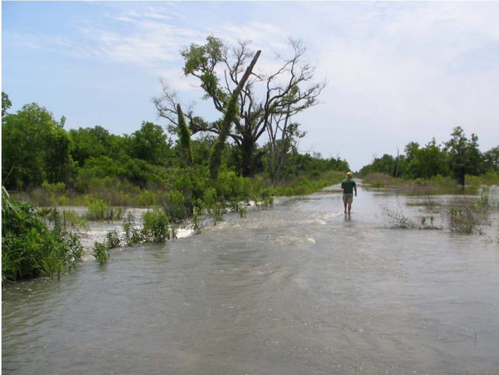
Figure 4: Mississippi River flow overtopping the road on the natural levee within the Bohemia Spillway area during high water on May 5, 2008

incision through the road and into the natural levee ( Figure 3 ). In addition, the natural levee and road were overtopped for 0.6 miles with a depth of 0.1 to 1.5 feet ( Figure 4 ).