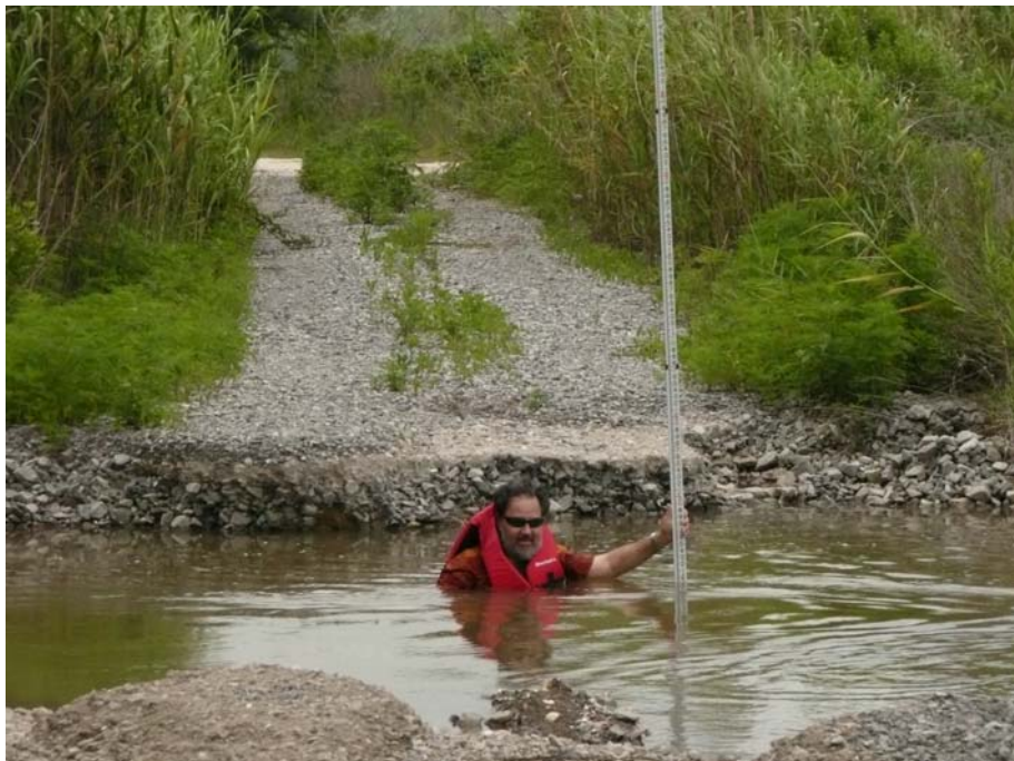
Figure 3: Mississippi River discharge through a breach eroded through the road and into the natural levee within the Bohemia Spillway area during high water on May 24, 2008.